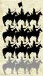
Boyar Sons sotnia