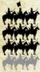
Boyar Sons sotnia