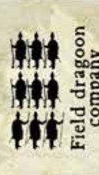
Field dragoon company