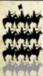
Boyar Sons sotnia