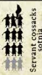
Servant cossacks sotnia