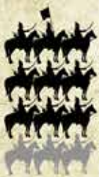
Boyar Sons sotnia