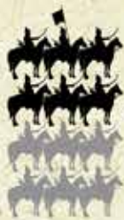
Boyar Sons sotnia