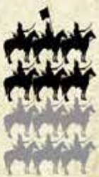
Boyar Sons sotnia