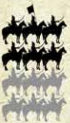
Boyar Sons sotnia