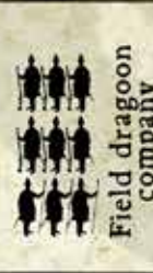
Field dragoon company