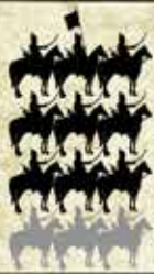
Boyar Sons sotnia