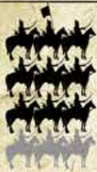
Boyar Sons sotnia