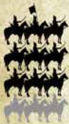
Boyar Sons sotnia