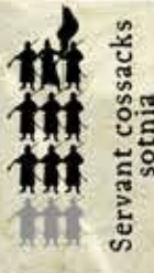
Servant cossacks sotnia