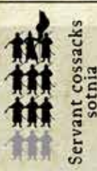
Servant cossacks sotnia